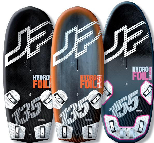
PRO 135 FWS 135 HYDROFOIL