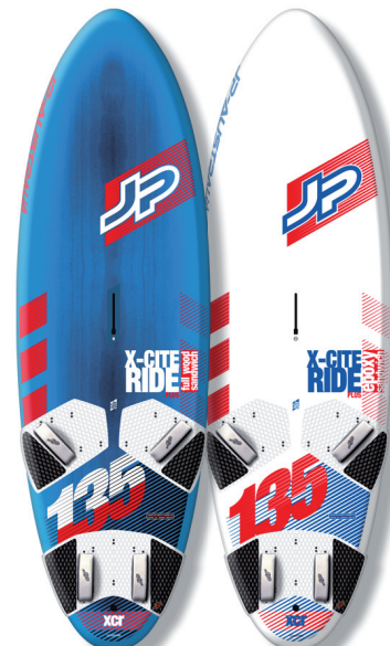
FWS X-CITE RIDE