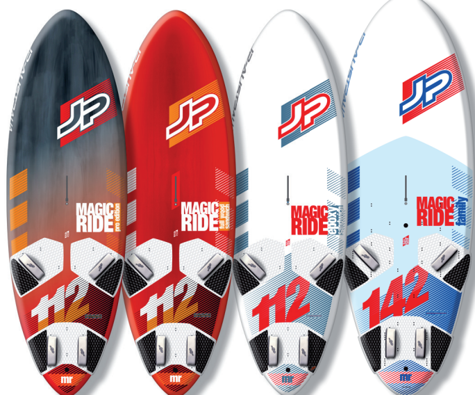
PRO MAGIC RIDE