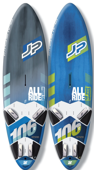
PRO ALL RIDE