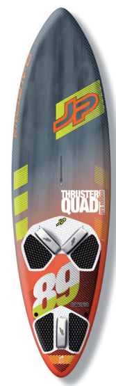
PRO THRUSTER QUAD