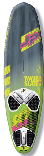
PRO WAVE SLATE