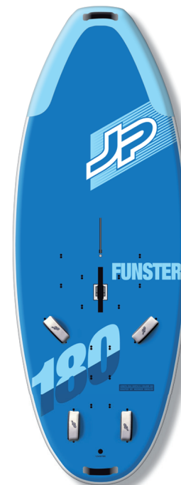
ASA / EVA FUNSTER