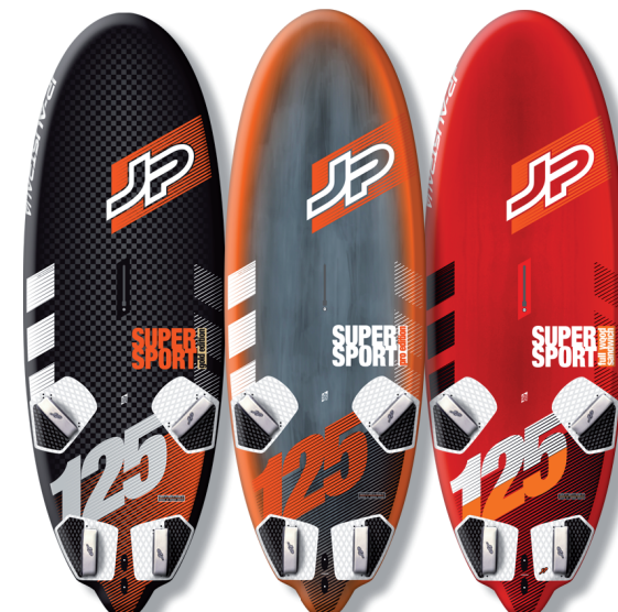
GOLD PRO SUPER SPORT