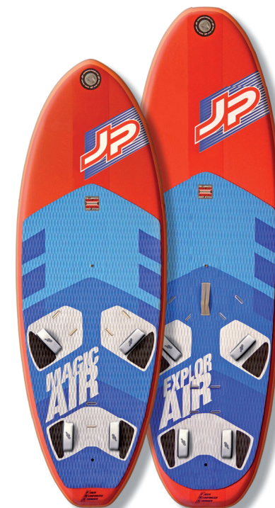
INFLATABLE MAGIC AIR