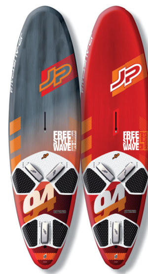
PRO FREESTYLE WAVE