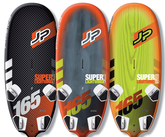
GOLD PRO SUPER LIGHTWIND