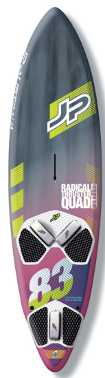
PRO RADICAL THRUSTER QUAD