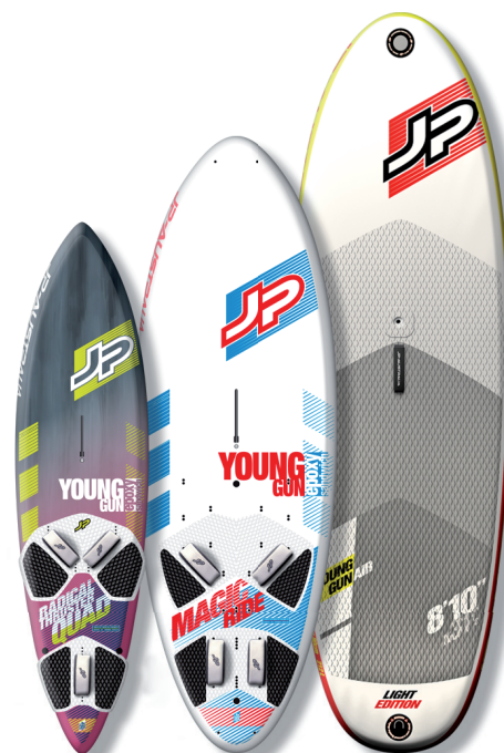
ES ES YOUNG GUN