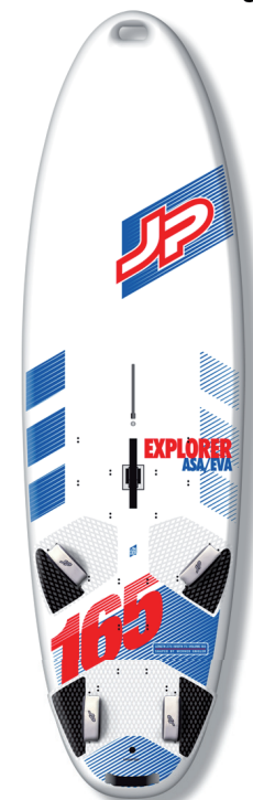
ASA / EVA EXPLORER